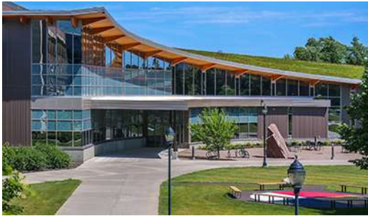
Students honored at Yellowjacket Student Excellence Awards May 20, 2021 in Awards and Recognition , Events