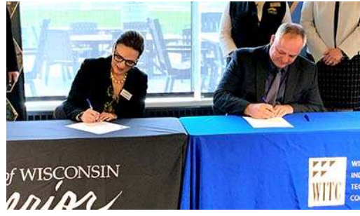
UW-Superior and WITC partner to offer innovative transfer degree program May 26, 2021 in Academic , Community Involvement