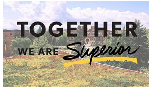
Superior Day of Giving tops $200,000 May 13, 2021 in Awards and Recognition , Events , Press Release