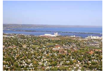
UW-Superior faculty and staff celebrated May 11, 2021 in Awards and Recognition , Events