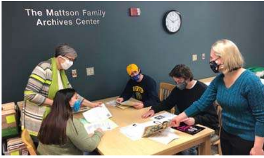
Students document history in First Nations course Jun 2, 2021 in Diversity , Press Release