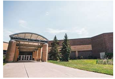
Marcovich Wellness Center re-opens to put summer membership sale Jun 10, 2021 in Community Involvement , Press Release